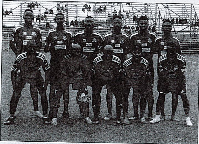
Geared to shame Mpheni Defenders on Saturday - Tshakhuma Tsha Madzivhandila FC.

Tzaneen United, fresh from a 3-1 victory over neighbours Nkowankowa Continentals, will take on Lebash Football Academy at the Nkowankowa Stadium. White Vultures and Baduzah Celtics will round off the weekend fixtures at the Selwane Sports Complex outside Phalaborwa.