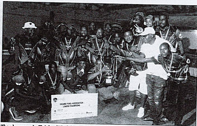
The players and officials of Vhulelu Pool Club celebrate with the team's trophy and cheque during the ceremony.